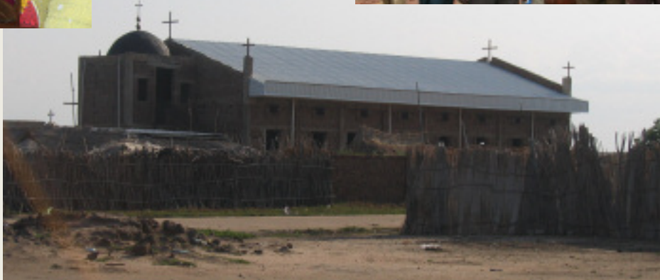
Stone on stone -- Cathedral rises in Sudan thanks to friends in Virginia.