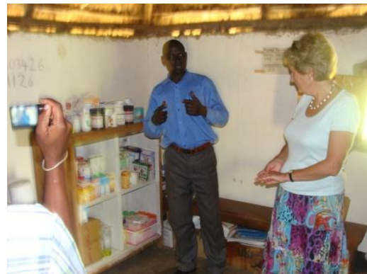
Kiri church clinic project

The Chairman toured CCMP practice church sites in Kiri, Liberty Baptist church in Pomoju, Leikor, Lire, the Cathedral and Canon Benaiah Poggo College. The communities and the people expressed their gratitude and appreciation for the empowerment they acquired through the support of Tear Fund. Some of the people were able to show the results of implementing the knowledge and skills they acquired through CCMP. (See pictures below)