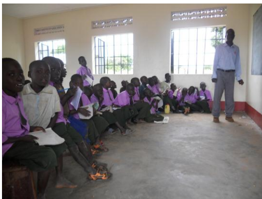
Pupils in a class

With or without furniture, the children of Dwani-Star of Bethlehem Primary School are already learning in their new building.