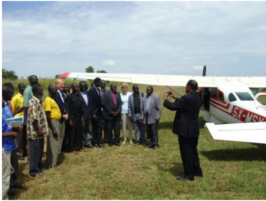
On arrival in to Kajo-Keji.