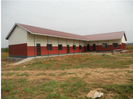
A classroom block