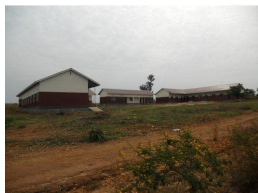
Romogi-Richard Earl High School

New Hope is now in the final touches of completing the construction of Romogi-Richard Earl High School. Once completed by mid-December, the ready furniture will be moved in. Students will start using the new facilities early next year when they reopen for the new academic year.