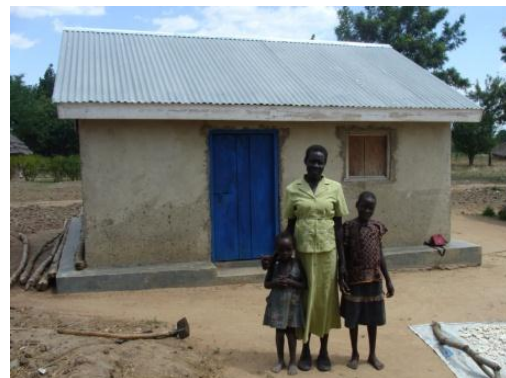
A widow in her improved house.

The Chairman toured CCMP practice church sites in Kiri, Liberty Baptist church in Pomoju, Leikor, Lire, the Cathedral and Canon Benaiah Poggo College. The communities and the people expressed their gratitude and appreciation for the empowerment they acquired through the support of Tear Fund. Some of the people were able to show the results of implementing the knowledge and skills they acquired through CCMP. (See pictures below)