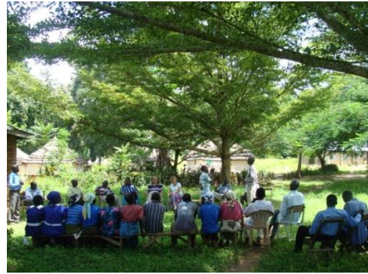
Meeting at Kiri Church.