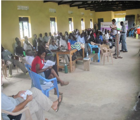
Participants at the Alpha training

The Diocese of Kajo-Keji, in collaboration with Alpha Uganda, held a Global Alpha Training (GAT) in Kajo-Keji from 26 th to 28 th October 2011. Alpha is a course that is aimed at people to know their faith and to build their relationship with Jesus Christ and it also enables Christians to grow stronger in their faith. .