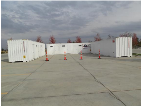
Containers ready for shipping to Kajo-Keji.