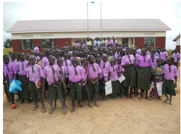
We are finally here, Dwani-Star of Bethlehem School children in front of the Admin block.

New Hope is now in the final touches of completing the construction of Romogi-Richard Earl High School. Once completed by mid-December, the ready furniture will be moved in. Students will start using the new facilities early next year when they reopen for the new academic year.