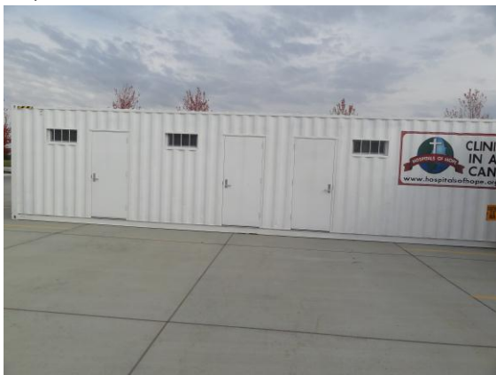
Good to start with this than to wait.

With one civil hospital serving a population of Kajo-Keji County, it is indeed welcome news to the people of this county that a new hospital is needed. Now a plan is on the way to build a 75 bed modern hospital in Lijo, along the Kajo-Keji-Moyo road and 9 miles