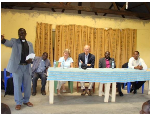
The Diocesan Secretary introduces staff to the visiting team.