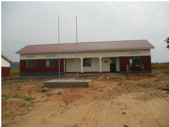
The office block

Once completed, Romogi-Richard Earl High School will bring to a total of six schools constructed by the New Hope funds – five primary schools and one secondary school as follows (in order of construction):