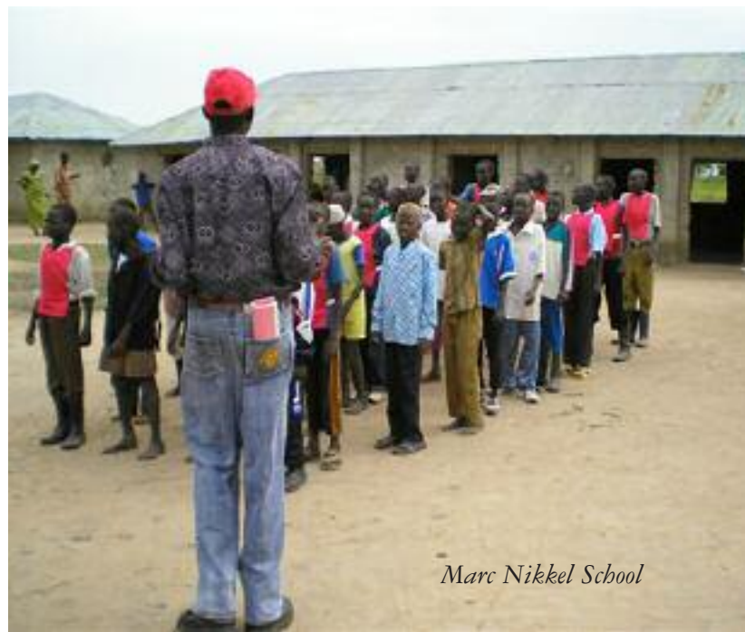
Marc Nikkel School

responded with open hearts and pocketbooks to help the Christian people of war-torn southern Sudan rebuild their communities, repatriate citizens, and create a future for their children at home. Nowhere is that generosity and Christian witness better expressed than in Maar where the Marc Nikkel School was officially dedicated and opened during our visit.