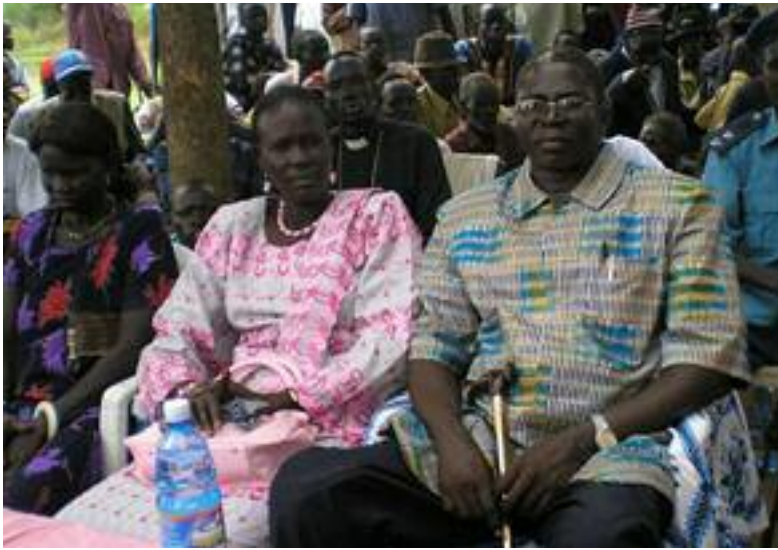
Commissioner of Jonglei state and his wife