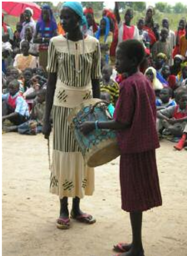
Welcome to Maar with songs and dancing.

years. The rest of us were newcomers to the village: fresh faces to meet and greet. Once inside the thorn tree and grass compound, we were ushered to plastic chairs we brought with us from Kenya (and left behind upon departure) carefully arrayed in a semi-circle. In a heart-rending Biblical ritual of welcome and love, our dis-