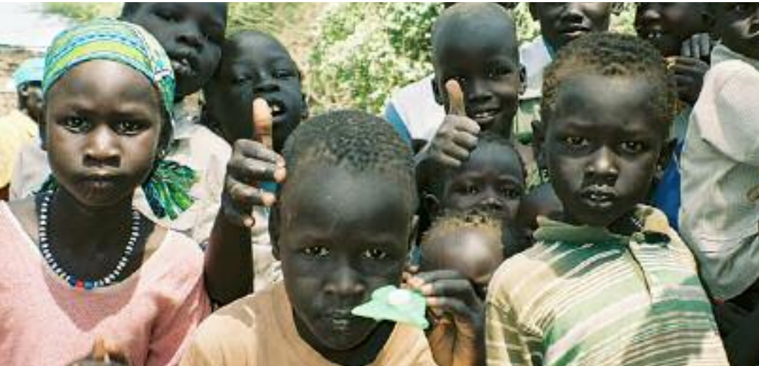
Sudanese refugee children at Kakuma