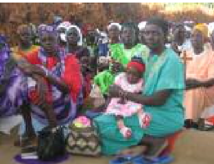
Women at church, Kakuma

It is impossible to separate the needs and plans of the Episcopal Church in Sudan from those of Sudanese civil