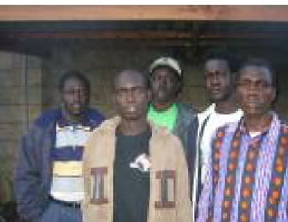
Nairobi: Youth Steering Committee of 300 member college-age group - "The Role of Youth in Post-Conflict Sudan"