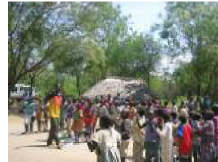
Malek bush school.

On one trip to Malek an armed escort was needed. There is a UN presence in Bor Town with SPLA and local security forces patrolling the streets; one of our traveling team was detained when he became suspect for taking pictures.