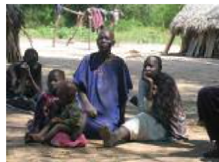
Women and children at Malek leper village