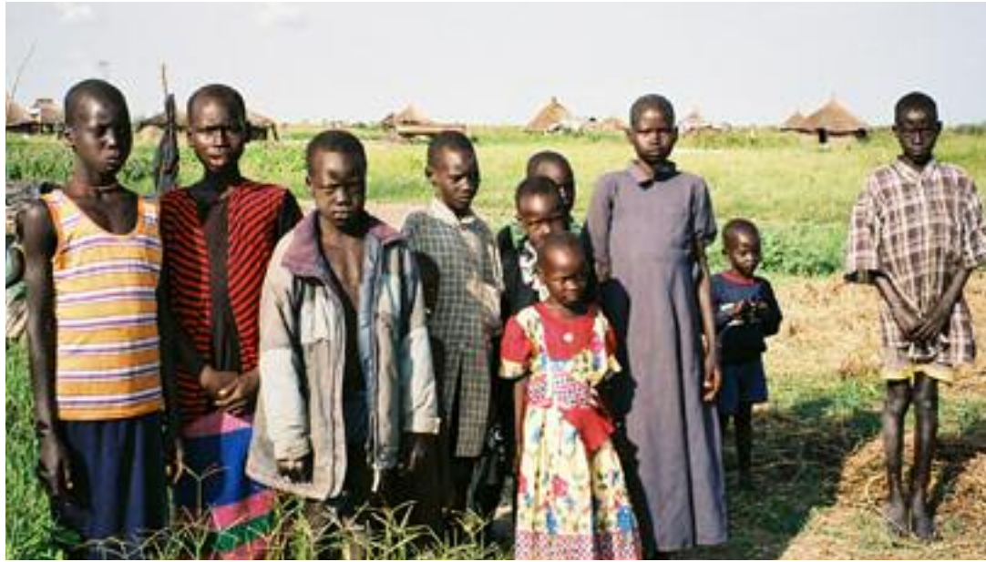
Sudanese children in Bor

Next fall, a census will be conducted in southern Sudan. We were told by a Commissioner in Bor that the refugees will be asked to return from Kakuma to be counted in the census. But, we were also informed that the United Nations has a policy of giving the refugees an option of returning to their homes or staying in the Camp. In other words, they cannot be forced to leave. People in the Camp will most likely insist on better security, schools and general infrastructure before returning to Sudan.