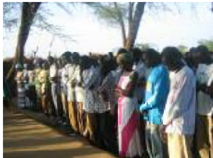
Kakuma: Students being prayed over prior to their qualifying exams.