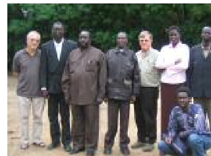
Bor Town: Meeting with Commissioner of Bor County (Center) and traveling team

Our meetings with leaders in various villages often touched on the desperate need to have agricultural technology brought to them, as well as simple needs of fishing nets and lines and hooks for places like the leper village at