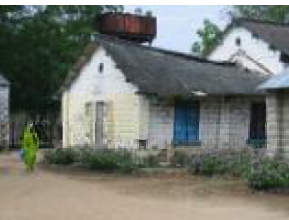
Bor Town: Surgery wing collapsing at the only hospital in the whole state of Jonglei – half the size of California

mango trees. Since January of this year, a borehole has been dug for water to somewhat improve the sanitation. Doctors Without Borders from Belgium is offering assistance. However, there are only two doctors on-site, one Sudanese and one Western, with a