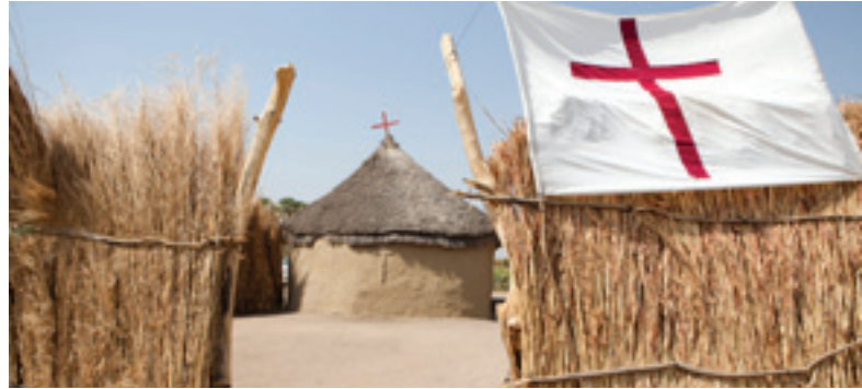
St. Mark, Jalbak, Renk Diocese.

ANNOUNCED BY PRESIDING BISHOP KATHARINE JEFFERTS SCHORI, SEPT. 15 ALERT TO AFRECS MEMBERS BY AFRECS_E-BLASTS@AFRECS.ORG, SEPT. 15