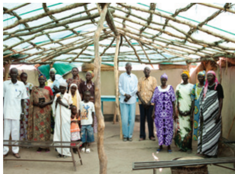
St. Barnaba, Renk Diocese.

Pray for our brothers and sisters in Sudan. Teach others about the plight of our Sudanese friends and families. Partner together to help our Sudanese brothers and sisters. Urge others to help. Give what you’re able -- time, talent, treasure. 🍇